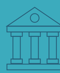
BLOM Bank Egypt